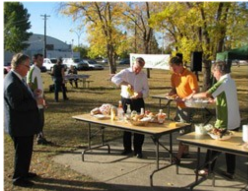
Great weather for EFCL's Open House and volunteer thank you barbecue on September 22, 2009

EFCL hosted an open house for all of our community league presidents, partner organizations and partners with the city. There was also a big thank you given to some of the great EFCL volunteers who helped with EFCL events such as the Heritage Festival or Talent Show. Volunteer appreciation is something that we take very seriously and the BBQ was a fun way to get together and talk about some of the big things that the EFCL is working on for the upcoming year. It was a wonderful day of sunshine and the attendees had the opportunity to see the archive photos freshly hung on EFCL's walls. Drop by our offices sometime and see what leagues have done over the past 90 years.