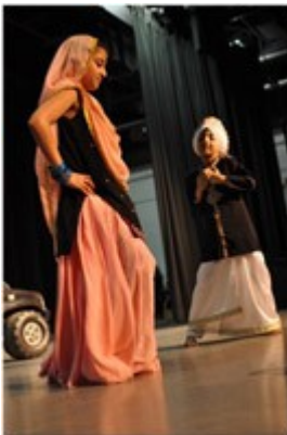
Spotlight on ethnic dance

We continue to bulk order membership supplies for our leagues that include membership cards, brochures, skate tags, volunteer badges. Please watch for the notices beginning every December, order on time, and confirm method of delivery or pickup. It helps the process. If you have any suggestions for supplies you would like to see or changes to the existing supplies, please contact communications@efcl.org .