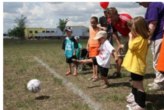
Pictured here is a little tike trying to score on some City Councillors at the Giant Community (Soccer) Party at Poplar Park.

And looking to the future, some of our older communities like Belvedere are starting to see the reappearance of soccer players in their communities. Belvedere wondered if soccer was done in their community, but this year they have a Little Kickers program and a U6 Soccer Team, the first in a number of years. A number of communities are experiencing the reappearance of kids in their neighbourhoods!