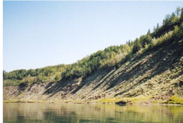
Accessibility to the river valley a key concern

Top of River & Ravine Bank Policy: The EFCL strongly advocated for public access to the top of river and valley banks. We emphasized the importance of a 100% continuous top of bank walkway which is integrated into a pedestrian friendly neighbourhood design; plus we requested pedestrian and emergency vehicle access to the walkway every 120 meters, the maximum block length in a pedestrian-friendly neighbourhood. These recommendations have been incorporated in to the new Top of Bank Policy.