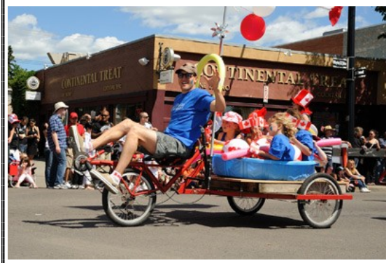
Friends of Scona Pool participate in this year's Silly Summer Parade on Whyte Avenue

The closure of 99<sup>th</sup> Street and Scona Road for rebuilding last summer was a difficult time for people and businesses in that area and it was disappointing that "Streetscaping" was not included as part of this project, but this is being addressed and will be done.