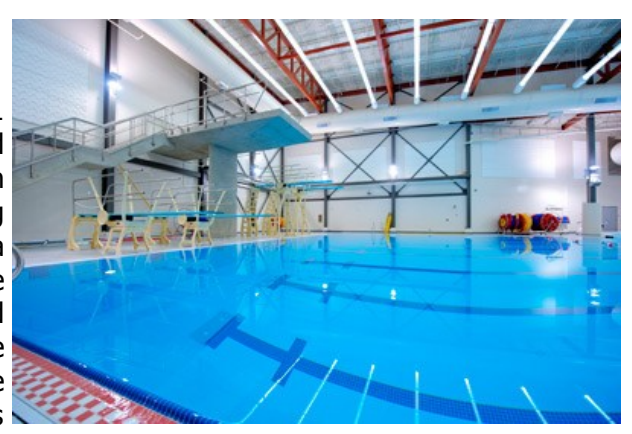
The Swimming Pool at Terwillegar Recreation Centre

The EFCL scored a breakthrough in 2011 when it convinced the city that leagues need their own swim booking and allocation process. It was agreed that holding consultations with leagues once or twice a year would help resolve issues with league swim programs. So far the City has offered five different options, which leagues are considering. The joint community league swim program, where two or more leagues rent a pool at the same time each week, seemed to be a favourite for many leagues as