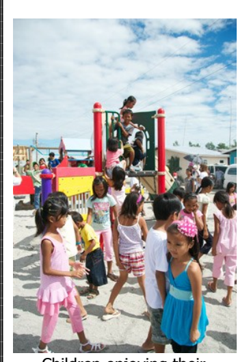
Children enjoying their new playground

The CDRS International group was recognized by the YMCA and was awarded the International Peace Medal. The EFCL recognized them during their Community League Showcase event and the group was called to city hall to be acknowledged by City Council earlier this year!