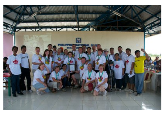
CDRS Volunteers Who Travelled to the Phillipines

In addition, early in 2011 a group of 19 volunteers travelled to the Philippines to construct a play ground in a small community. The group refurbished several structures that were removed from our District Park. A community Play school was donated, along with many uniforms, equipment and school supplies. Clothing items, tools, and gardening equipment was also packed into a "Seacan", which was used to ship all of the material overseas. The group fundraised for the "Seacan", but the volunteers took holidays and paid their own way to construct the playground.