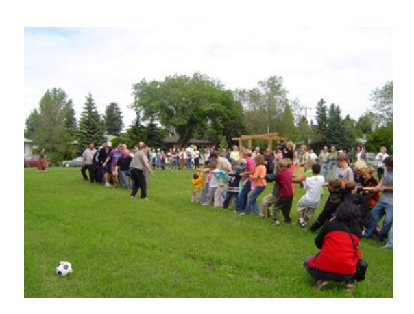
Kids versus adults at Belgravia's Arts Park Grand Opening