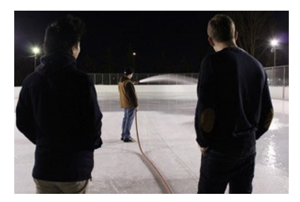
Getting the ice ready at Grandview