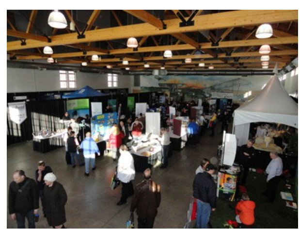
EFCL Community League Tradeshow 2011

Building on the success of the first EFCL Tradeshow, the EFCL hosted an EVEN BIGGER show on January 22<sup>nd</sup> 2011. We were thrilled to have over 300 community league executives come and take part in a "one-stop-shop" for all of your community league needs. Exhibitors and non-profit partners set up shop together in Fort Edmonton Park and helped inspire and educate community league volunteers from around the city. This event could not have succeeded without the featured presenters: Habitat Playground systems, United Cycle, Flex Court Canada, Special Event Rentals, Foster Park Baskett, Play Works, and our