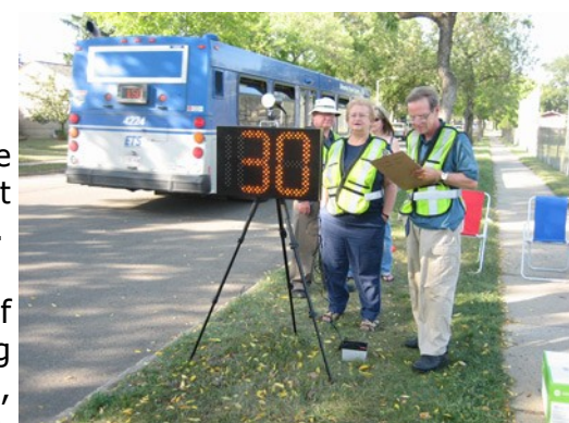
Members of Woodcroft Community League check speeds through their neighbourhood.

The decision was made following a survey of residents in each of the communities. A strong majority supported the 40 km/hour limit in Ottewell, King Edward Park and Woodcroft communities, where the program will be retained. The speed limit has returned to 50 km in Westridge/Wolf Willow,