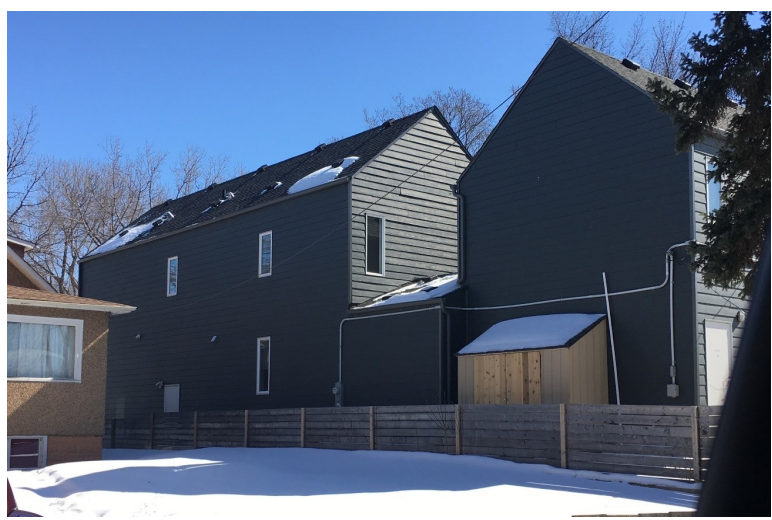
Image 5: Example of a breezeway connection in Highlands, Edmonton compounding the massing effect of an adjacent dwelling.

Background: The EFCL Planning Committee met with Administration working on the potential of allowing breezeways, which are enclosed walkways between two structures such as a house and a rear garage. The Planning Committee advised that they are not in support of breezeways as they are an inefficient use of land in a compact city and because they create significant visual barriers for neighbours, as illustrated in the photo below.