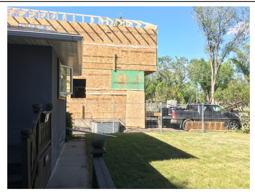
<u>Image 3</u>: Photo of a development in Inglewood, Edmonton that illustrates the disharmony created with the new setback regulations.