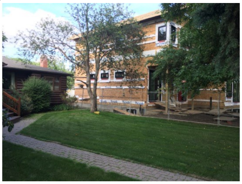
<u>Image 4</u>: Photo of a development in Windsor Park, Edmonton that dwarfs its neighbour due to changes to front set back regulations.

<u>Outcome:</u> No action. Recommendations from Administration passed.