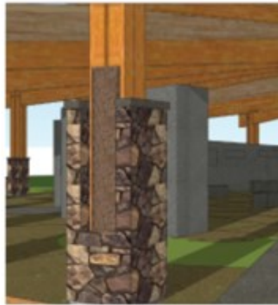
Column Panel Signage