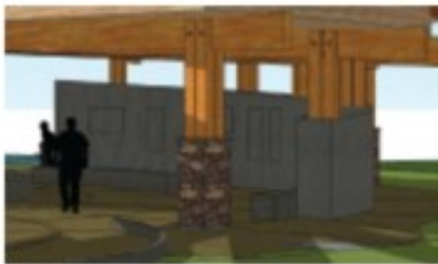
Donor Wall, Plaza Feature Wall