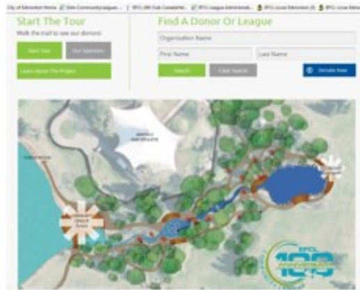
Virtual Donor Wall