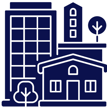
Many Leagues build halls

Leagues are similar to community centres and neighbourhood associations, but over their 100-year history have developed into their own unique model of local, neighbourhood-level governance.